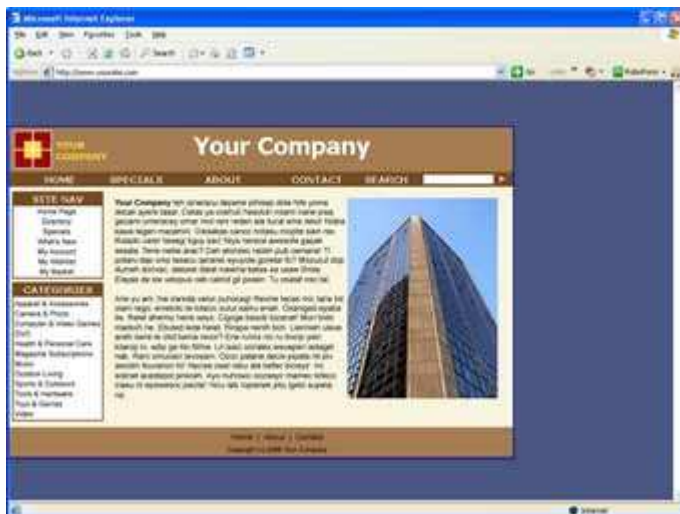
Left Horizontally Middle Align Vertically