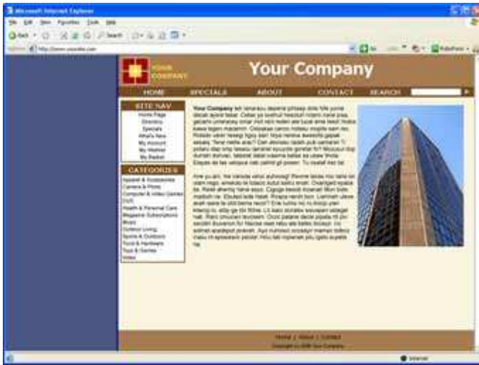
Right Horizontally Fill 100% Vertically