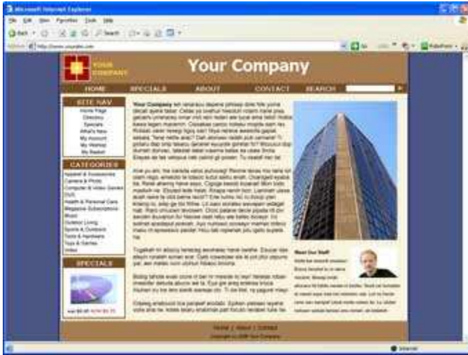
800 x 600 formatted site in a 1024 x 768 browser window.