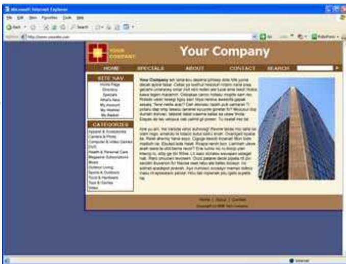
Right Horizontally Top Align Vertically