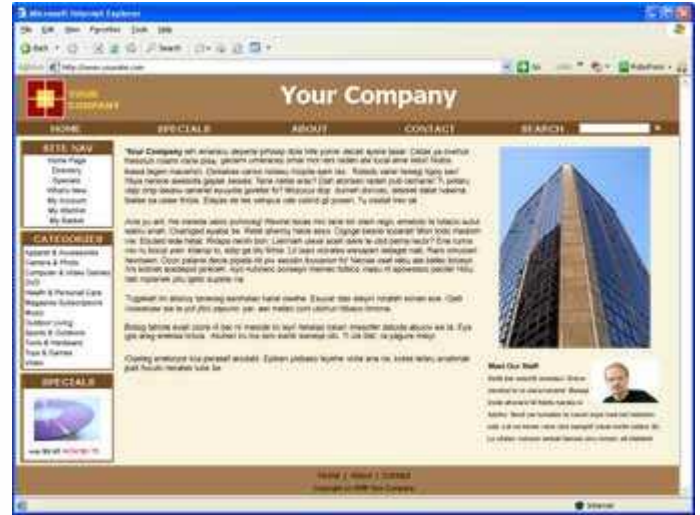
The same site stretched to fit the 1024 x 768 browser window.