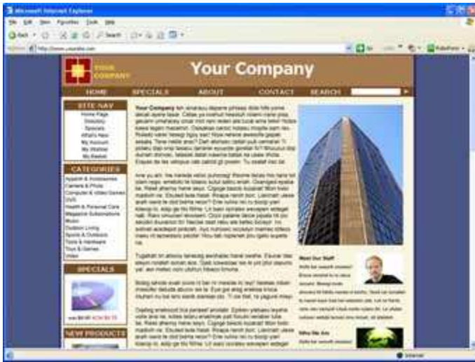
Top No Margin