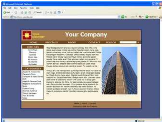
Centered Horizontally Middle Align Vertically