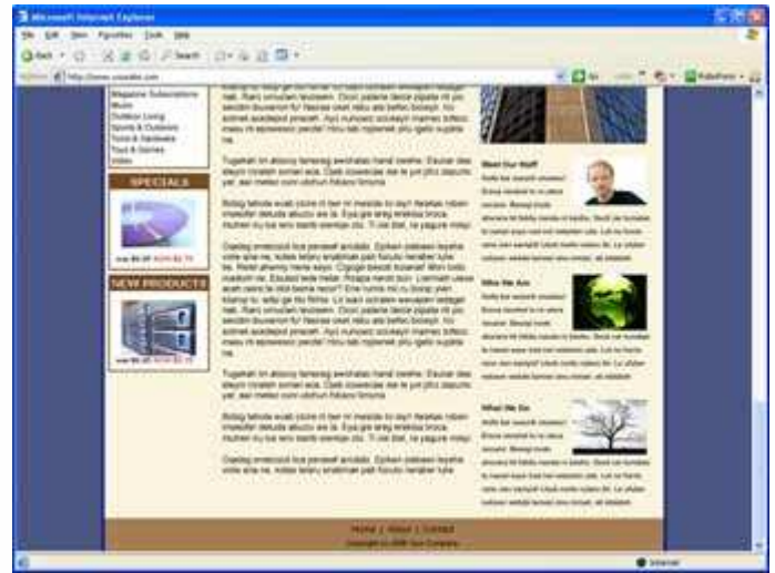
Bottom No Margin