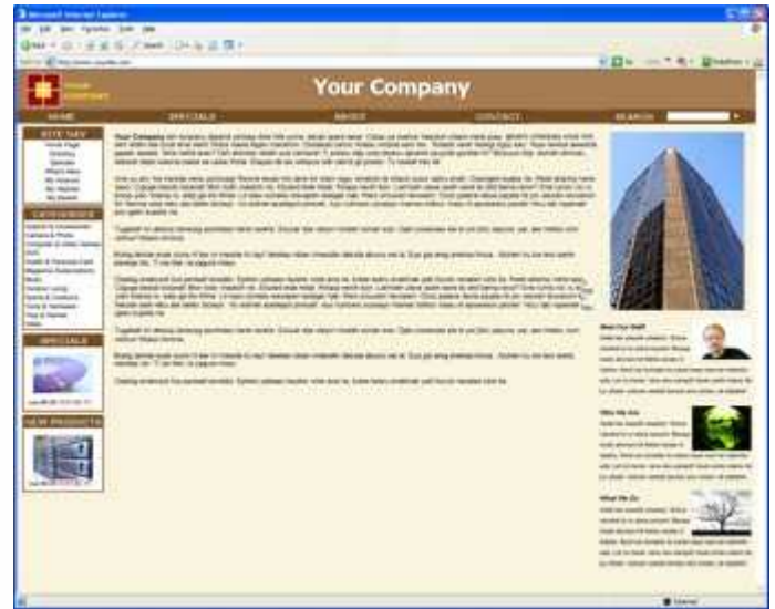
The same site stretched to fit the 1280 x 1024 browser window.

NOTE: A 1024 x 768 formatted site will look similar to the top left image on screens that are larger than 1024 x 768 and similar to the top right image on 1024 x 768 screens. On 800 x 600 screens, a 1024 x 768 formatted site will require horizontal scrolling. The bottom images illustrate how fixed-width formatting remains consistent on larger monitors while stretch-to-fit formatting changes with the size of the browser window.