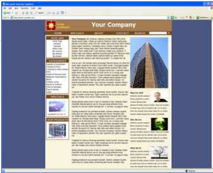
800 x 600 formatted site in a 1280 x 1024 browser window.