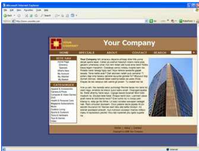
Right Horizontally Middle Align Vertically