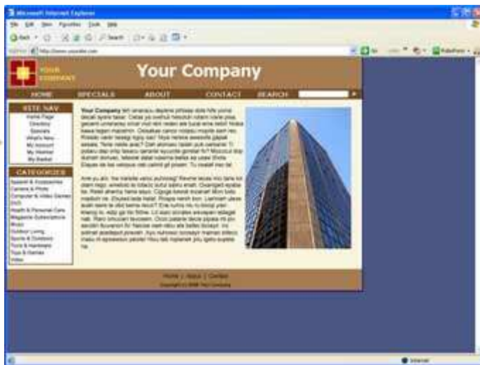
Left Horizontally Top Align Vertically