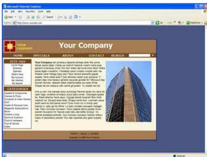
Left Horizontally Middle Align Vertically