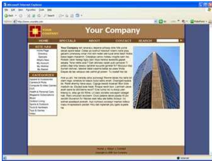
Centered Horizontally Fill 100% Vertically